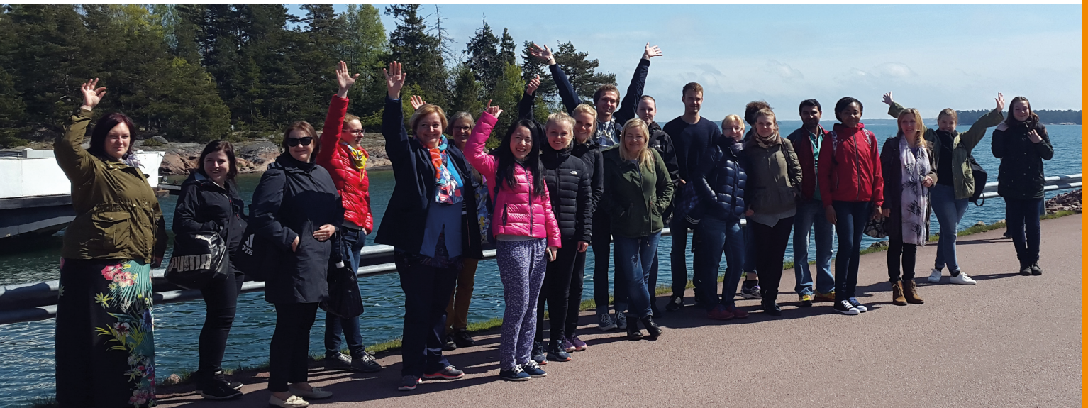
Participants in Mariehamn 2015.