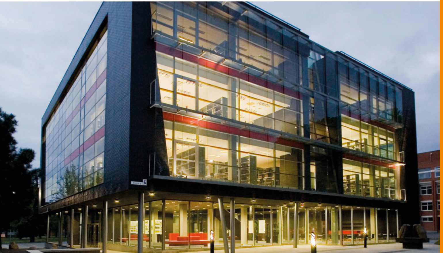
Lithuanian University of Health Sciences, Kaunas.